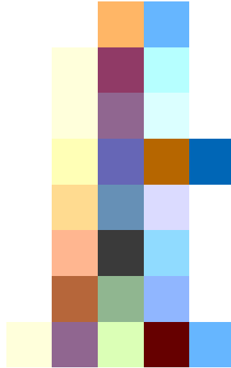
Fig. 1. Comparison between one spark in center and two sparks located at two sides

volume of single ignition. When the time exceeds 0.0005 seconds, the two flame surfaces of double spark plugs are intersected, the combustion volume is no 2 times of the combustion volume of single spark plug. All the flame surface reach the whole combustion chamber in about 0.0008 seconds, and the frontal area The calculation is consistent. In general, in the range of from 0 to 0.0008 seconds, the combustion volume of double ignition is greater than the combustion volume single ignition.